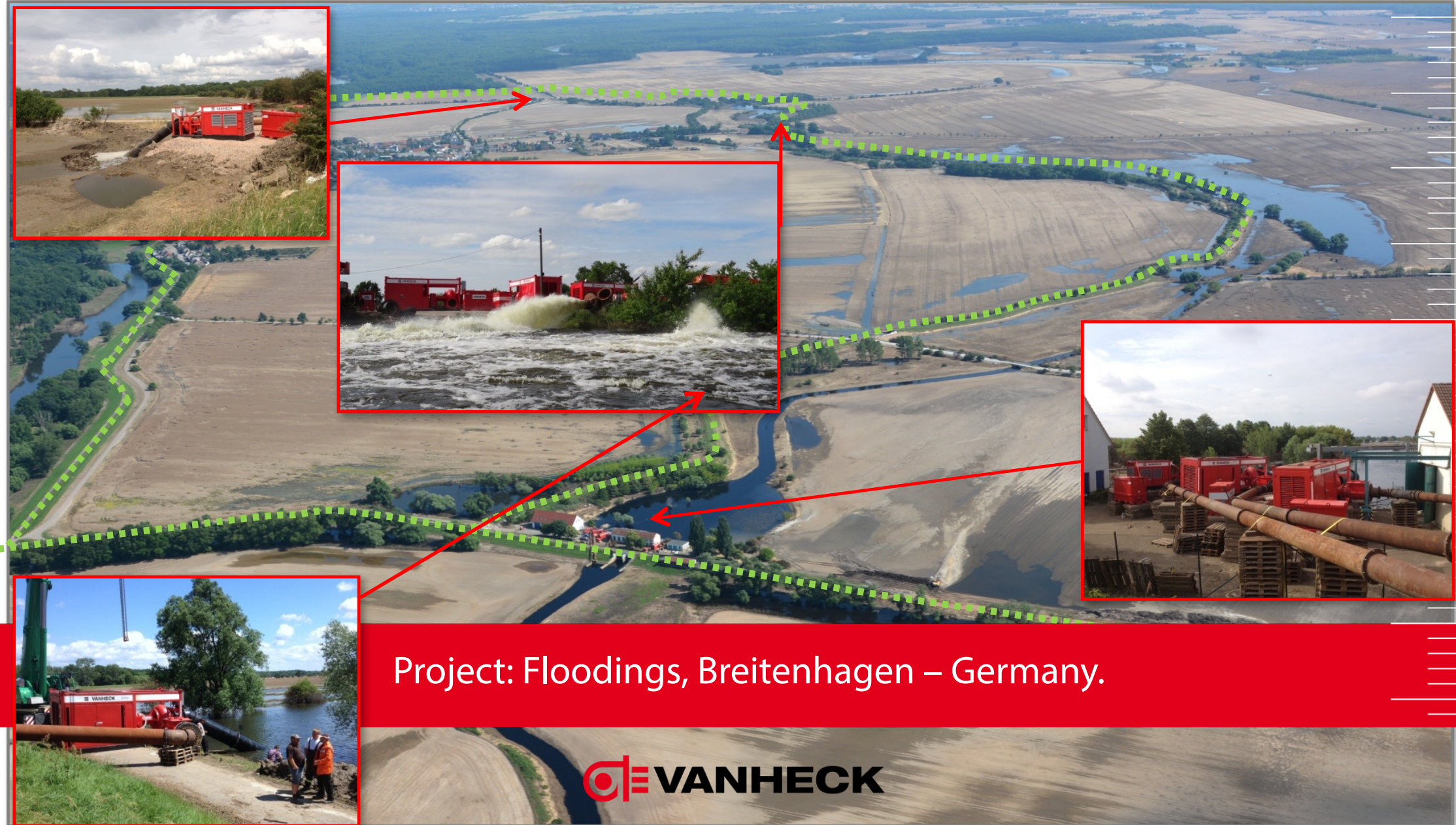
Project: Floodings, Breitenhagen – Germany.